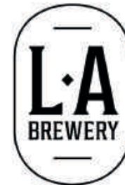
DRINKS LA Brewery