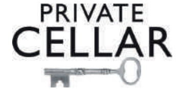
WINE Private Cellar