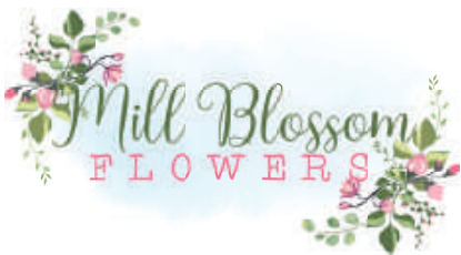
FLORIST Mill Blossom Flowers